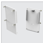
Hole:50708 W/O hole: 50709